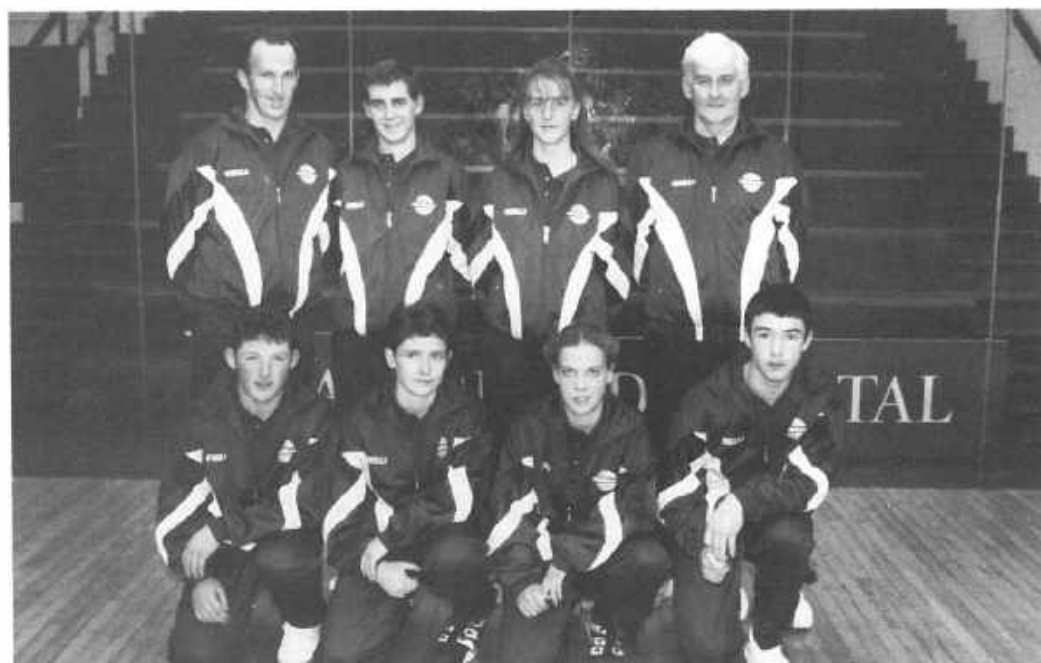
The Irish youth team which took part in the U.S.H.A. Junior Championships in Orlando: