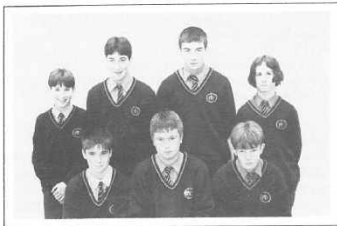
Boys Committee of St. Augustine's Club, Dungarvan