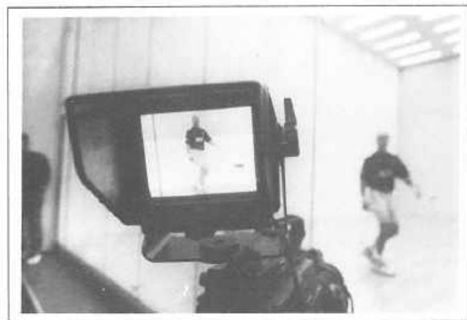
RTÉ recording in progress during the Open Singles event.

On behalf of everybody who took part in or was associated